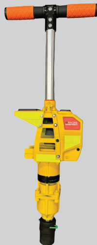
T-Handle Impact Wrench