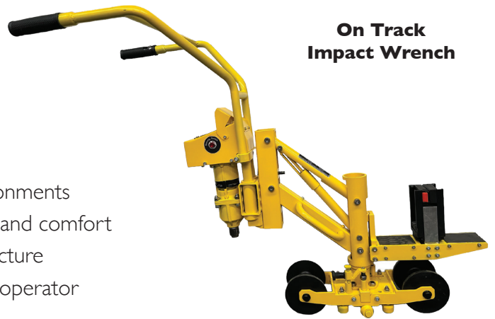
On Track Impact Wrench