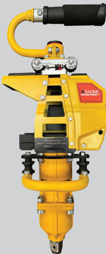
D-Handle Impact Wrench